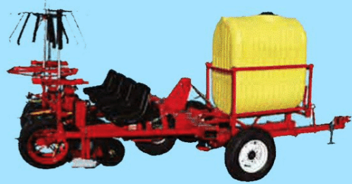
Model 803 2 1000 shown as on the left only with optional carousels instead of plant boxes. Not shown, but optional are 2 or 3 shelves for each side of tank for plant storage.