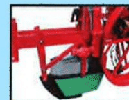
Optional 395RP Poly Non-stick Shoe