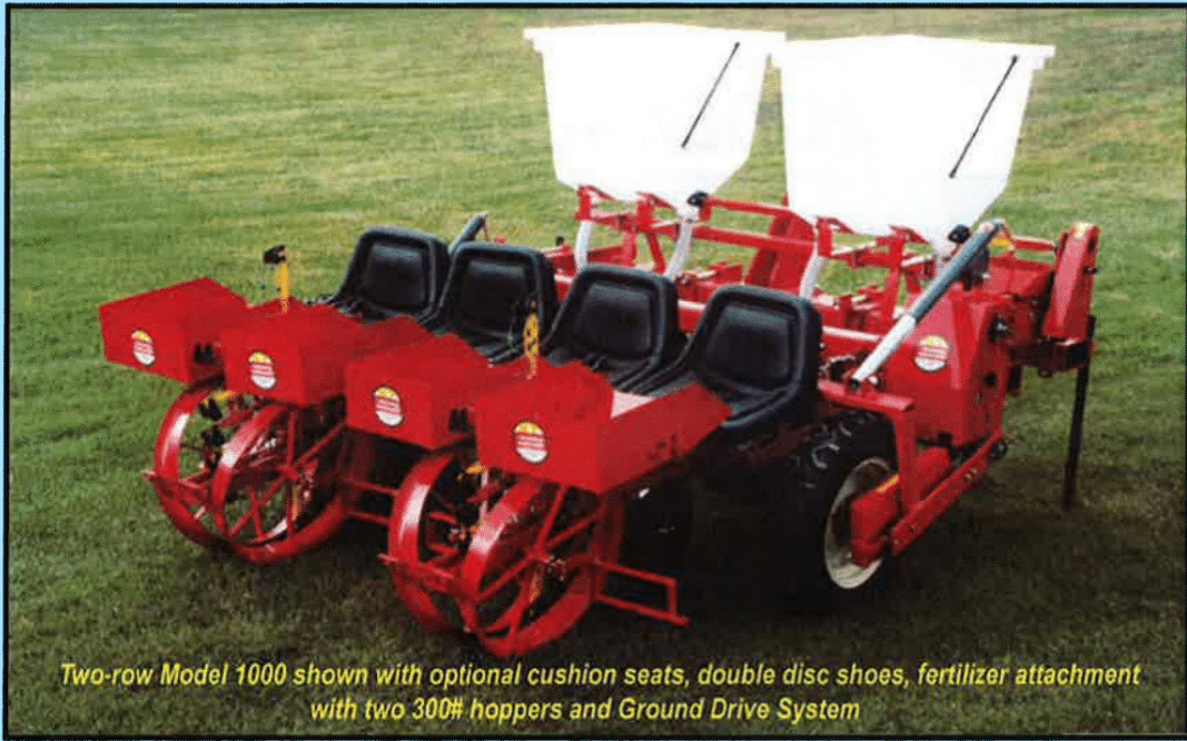
Two-row Model 1000 shown with optional cushion seats, double disc shoes, fertilizer attachment with two 300# hoppers and Ground Drive System