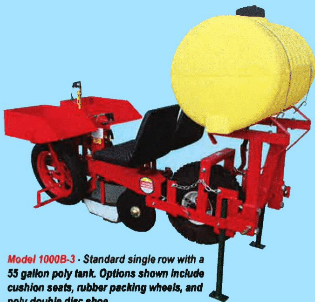
Model 1000B-3 - Standard single row with a 55 gallon poly tank. Options shown include cushion seats, rubber packing wheels, and poly double disc shoe.