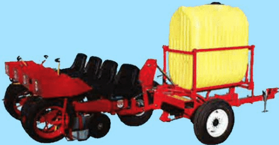
Model 803 2 1000 - Two row with NEW 803 heavy duty trailer. Shown with upright 300 Ga. tank, telescoping tongue, 4x7 toolbar and two Model 1000 units. Options: cushion seats, double disc poly shoes, rubber packing wheels and 7:60 x 15 tires.