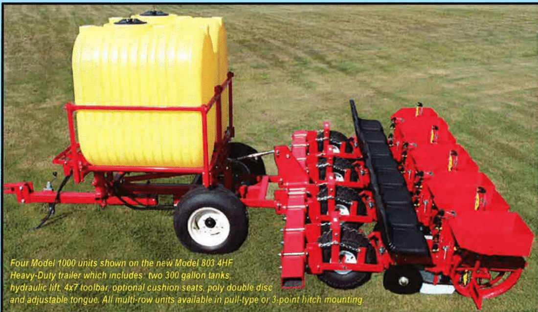
Four Model 1000 units shown on the new Model 803 4HF Heavy-Duty trailer which includes: two 300 gallon tanks, hydraulic lift, 4x7 toolbar, optional cushion seats, poly double disc and adjustable tongue. All multi-row units available in pull-type or 3-point hitch mounting.