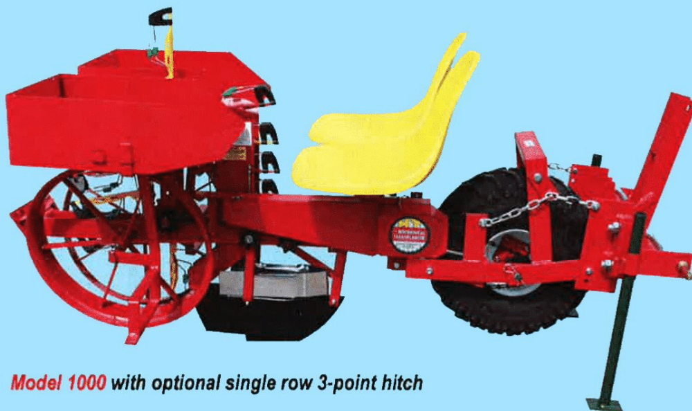
Model 1000 with optional single row 3-point hitch

OUR PATENTED FLOAT WHEEL DIRECT DRIVE SYSTEM maintains correct ground contact at all times for both the drive wheel and rear packing wheels letting the units float independently for any number of rows. The wheel smoothes, firms and ideally prepares the soil providing accurate plant placement and proper depth control in all soil conditions.