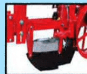
Standard 395R Round Point Shoe