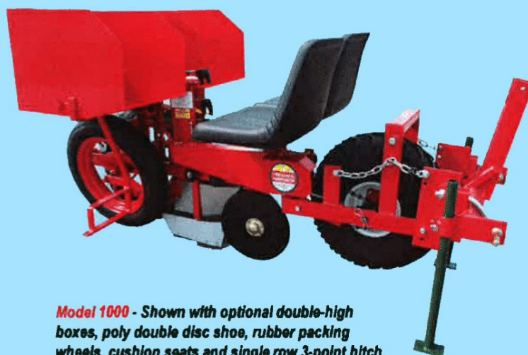
Model 1000 - Shown with optional double-high boxes, poly double disc shoe, rubber packing wheels, cushion seats and single row 3-point hitch.