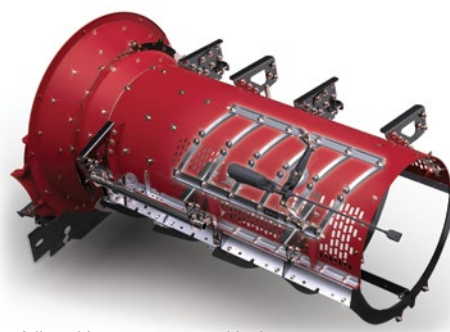
Adjustable cage vanes provide the operator the ability to optimize threshing and separating.